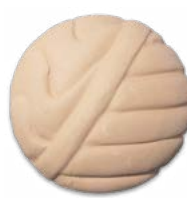
No. 29 Brown Stone Earthenware Clay