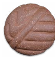
No. 77 Terra-Cotta Clay