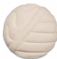
No. 25 White Art Clay