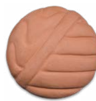
No. 67 Sedona Red Clay